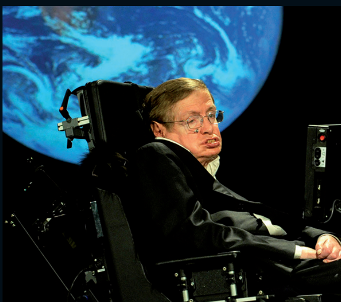
S. Hawking

Building on the work of Bekenstein, Hawking suggests that black holes behave much like a pot of boiling water.