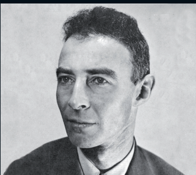
R. Oppenheimer

Oppenheimer and Snyder show that the gravitational collapse of very massive stars is unstoppable and forms black holes.