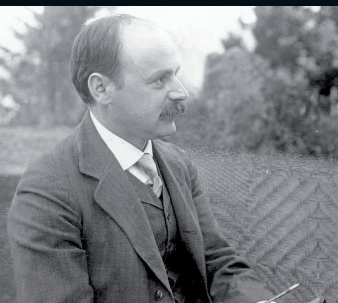
K. Schwarzschild [P.D. [CC]]

Schwarzschild finds the first solution of Einstein's equations: a black hole that does not rotate.